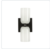
WS57712-BK/GO Black/Glossy Opal Glass